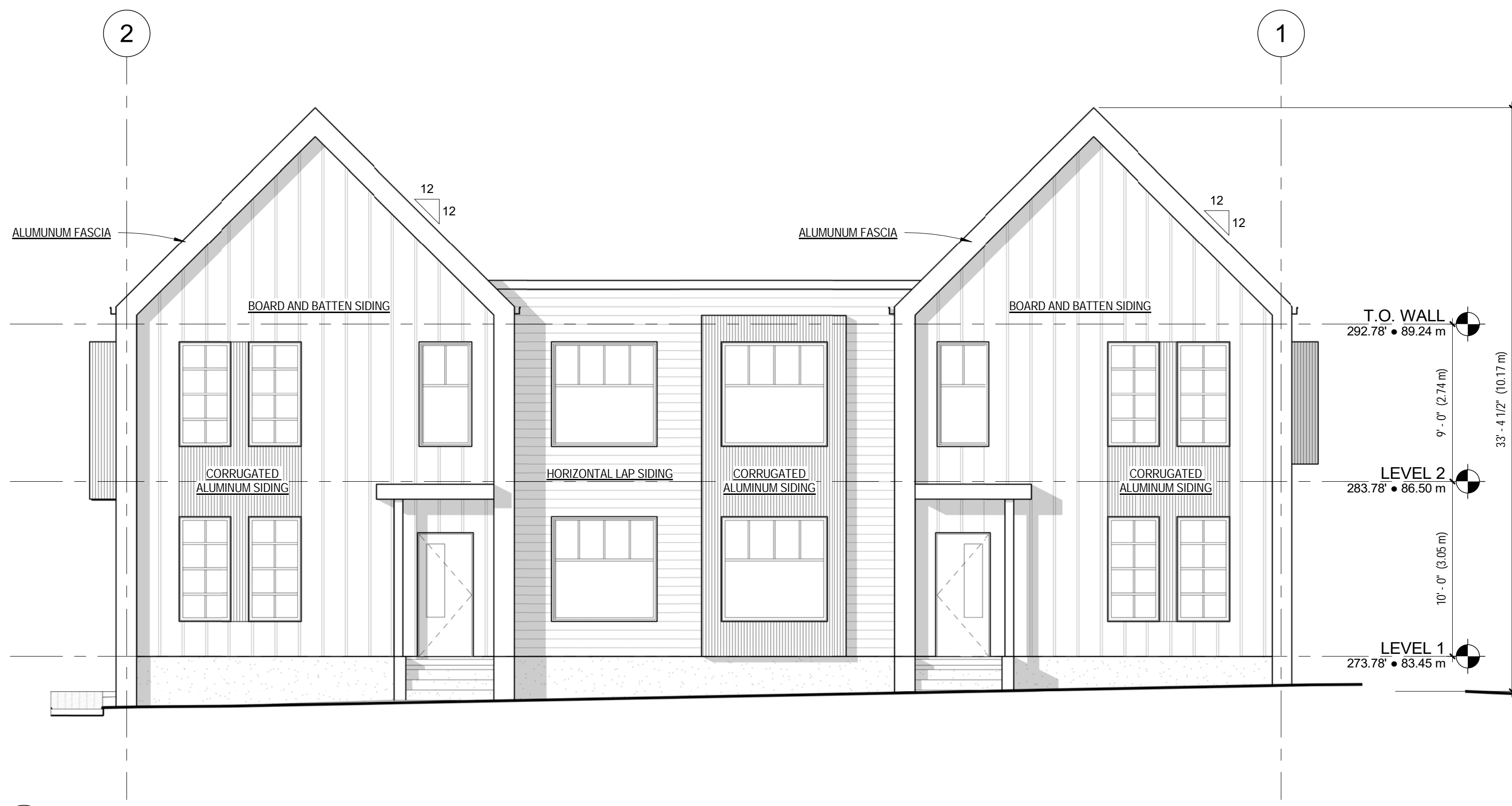
1 NORTH ELEVATION 3/16" = 1'-0"