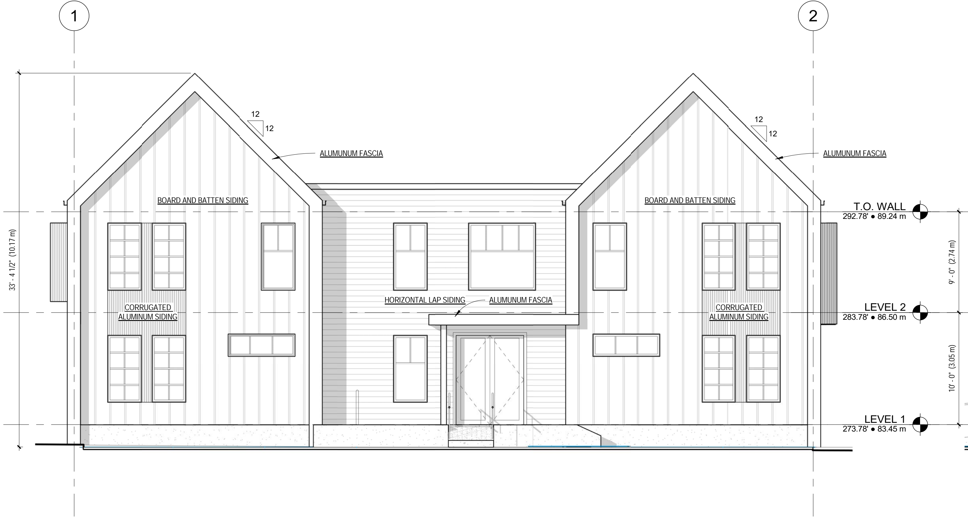
3 SOUTH ELEVATION 3/16" = 1'-0"